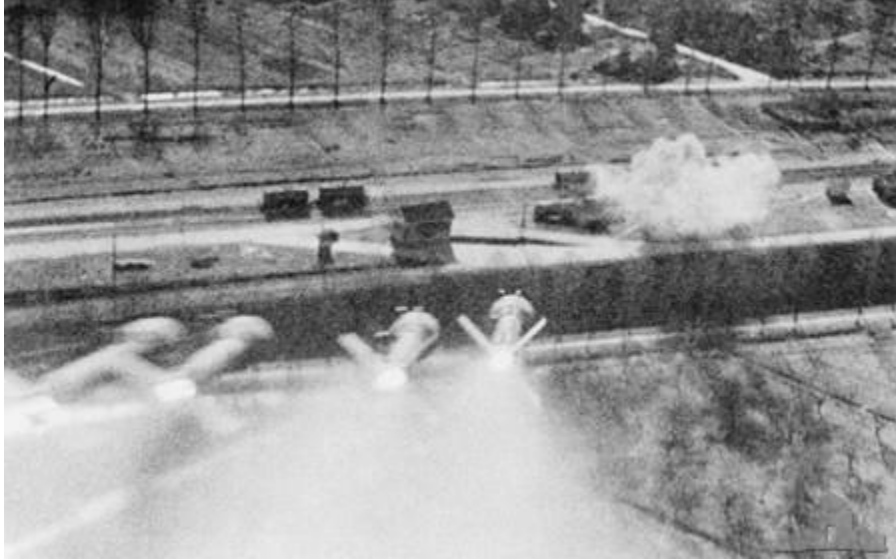
HARVS on the way in shot by a P-47. Rare shot.