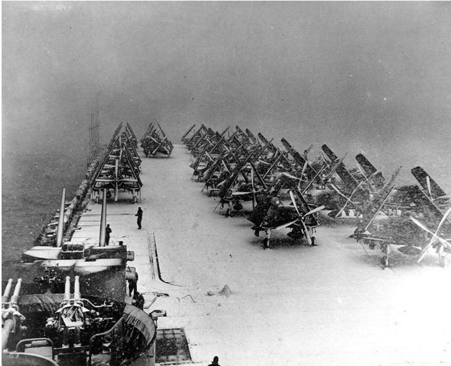
Snow on deck.. USS Philippine Sea North Pacific 1945