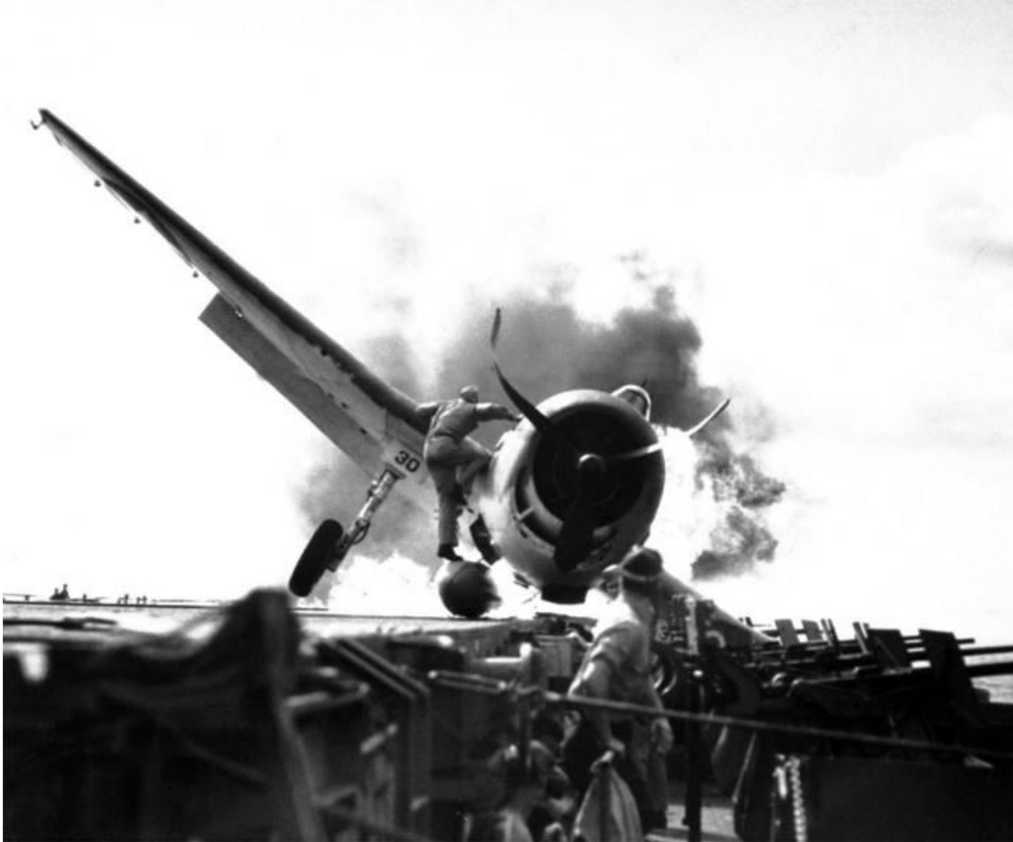
Deck crew climbing up to get the pilot out. He did. That's a fuel tank his foot is on. Empty?