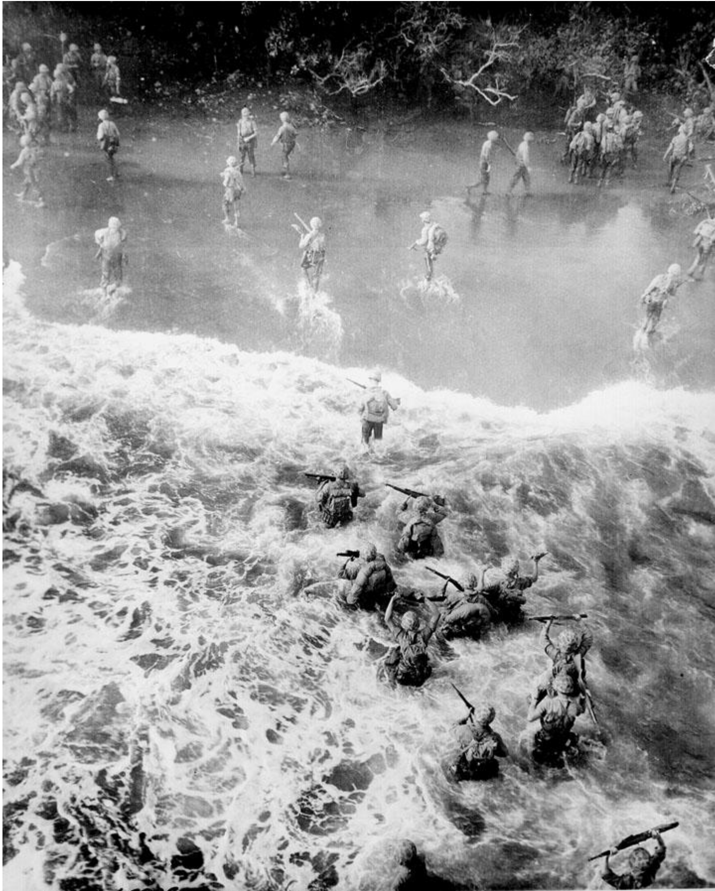
Marines disembark LST at Tinian Island .