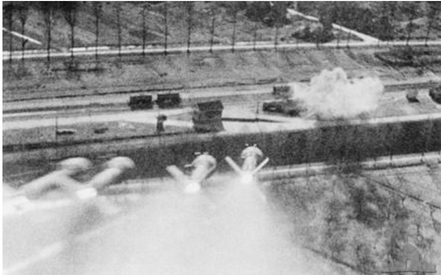
HARVS on the way in shot by a P-47. Rare shot.