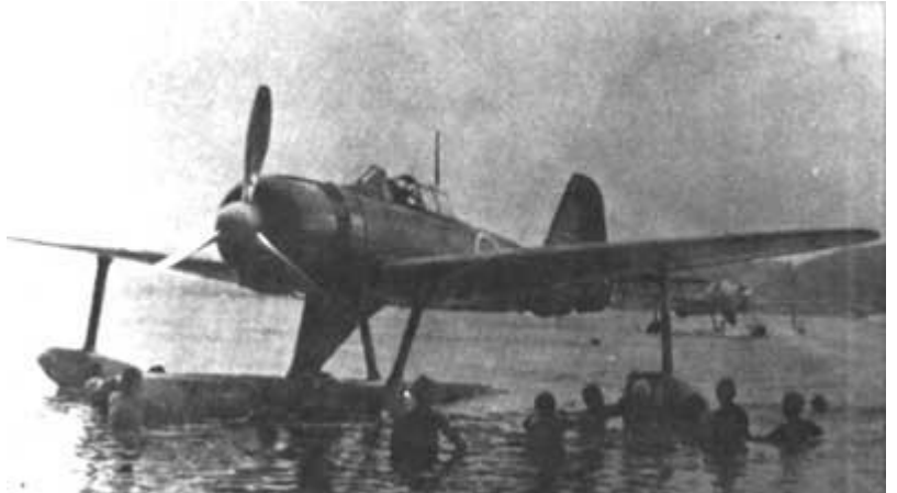
The A6M2-N float plane version of the Zero did extremely well, suffering only a small loss in its legendary maneuverability. Top speed was not affected, however, the aircraft's relatively light armament was a detriment.