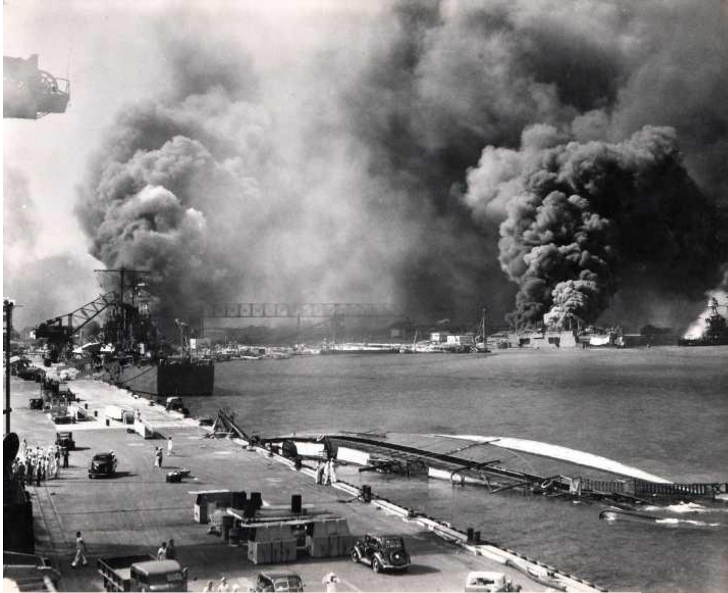
PEARL HARBOR December 7th, 1941