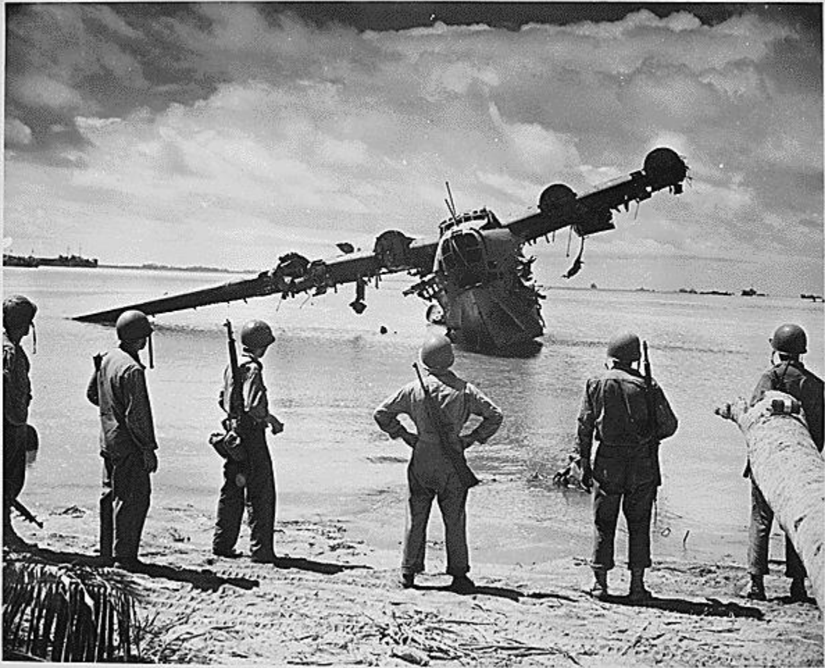
Japanese Kawanishi H8K seaplane after strafing. Kwajalein

Where have these pics been hiding for the past 65 years?