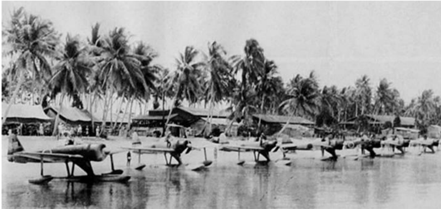
Squad of Rufe's at Bougainville . These things were very nimble even with the pontoons.